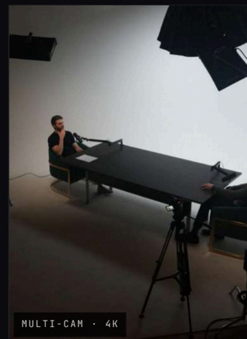
MULTI-CAM · 4K