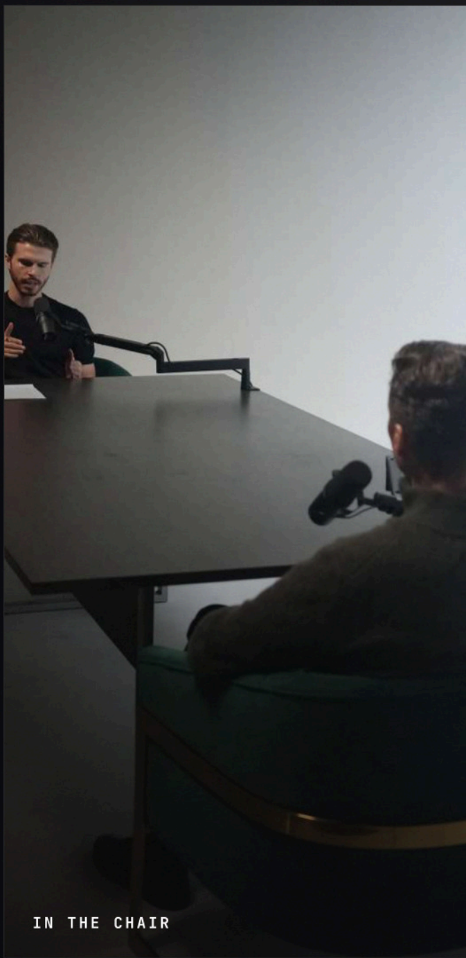
IN THE CHAIR