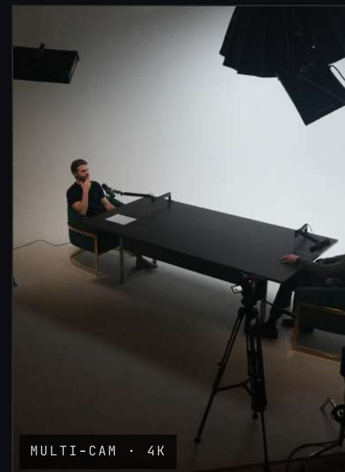
MULTI-CAM • 4K