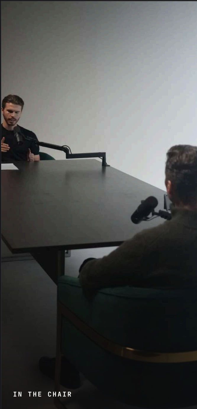
IN THE CHAIR